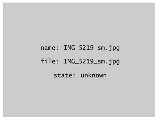
Figure 4 One of my sprang posters (in Finnish)

The texts are printed into frames, but after that I put everything together by hand, so they have a slightly old-fashioned feel, but are still legible. If I want to change the texts, I only need to replace the damaged texts, samples and backgrounds, but do not have to start over from beginning.