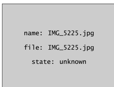
Figure 6 "Hearts", my two-colour variation of Grene Dorge. Pearl cotton nr 8.

In my other material English comes first, but the instruction sheets will be done in Finnish first as there's a demand for such a material among others at schools. This is where I'll be deciding on what kind of terminology to follow in Finnish, so it is important for me to start with the most extensive instructions and then do the shorter versions later, based on my English sample books.