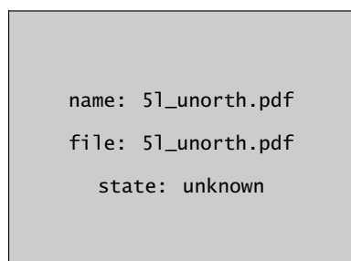
Figure 5 A first attempt to describe the 5-loop un-orthodox braid

there's no reason to deviate from what is more or less the standard in the field.