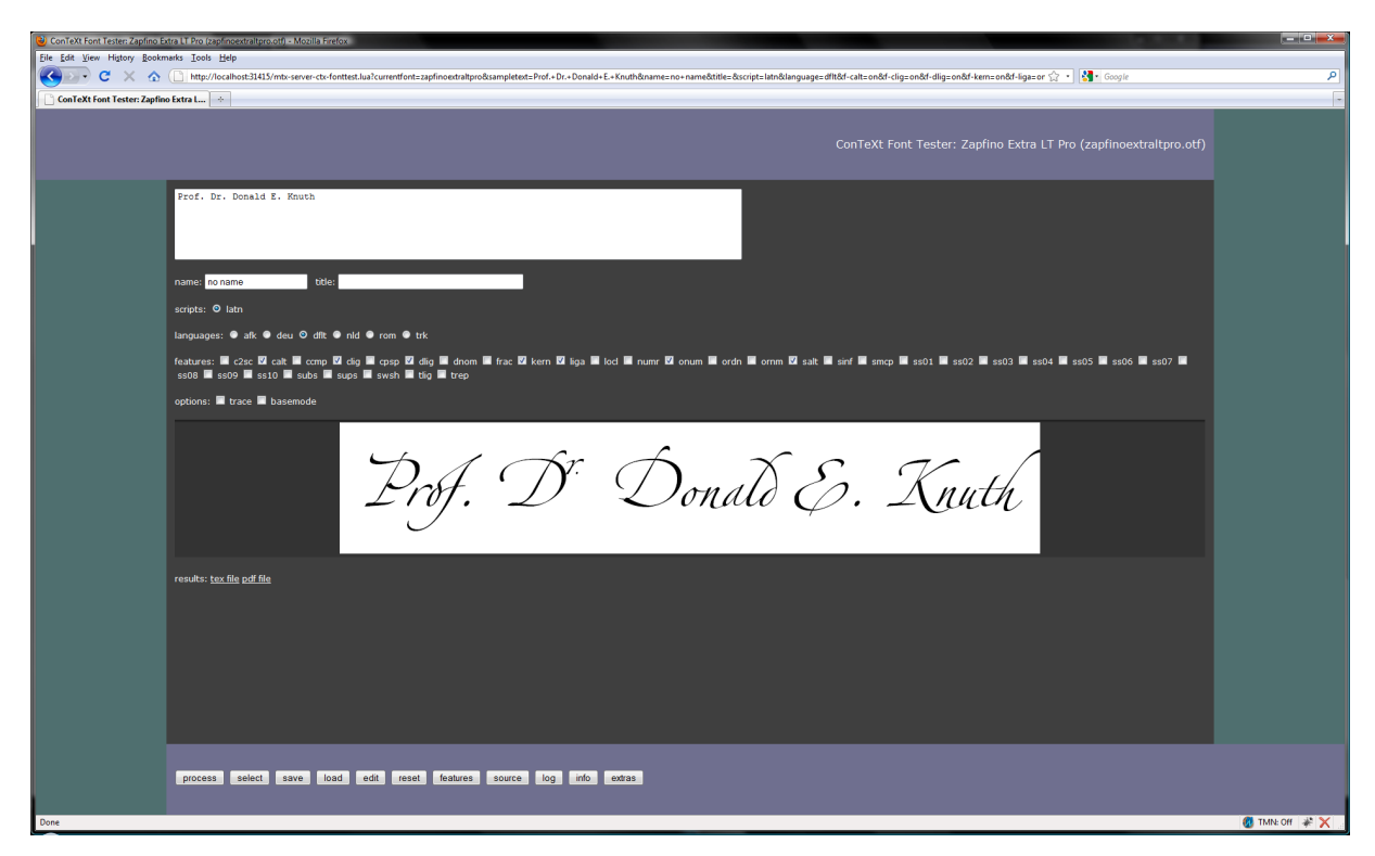
Figure 2. An example of using the font tester.