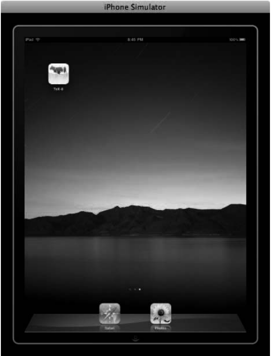
Figure 3 The TeX-8 application in its natural habitat