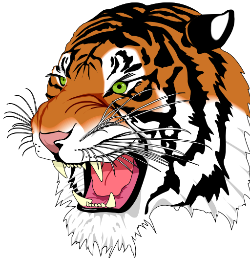
Figure 3. This is the caption of the figure. This is the tiger from the GhostScript distribution.

If you rotate a float, it will always use an entire page.